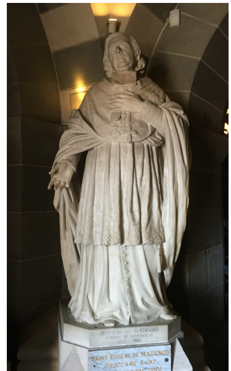
Statue of St. Eugene de Mazenod in the Basilique Notre-Dame-de-la-Garde in Marseille, France.

Access the LIVE stream at www.facebook.com/stpatrickshamilton or www.stpatrickshamilton.ca