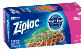
Ziplock Snack Bags