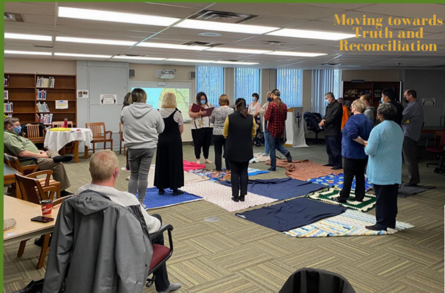
Moving towards Truth and Reconciliation