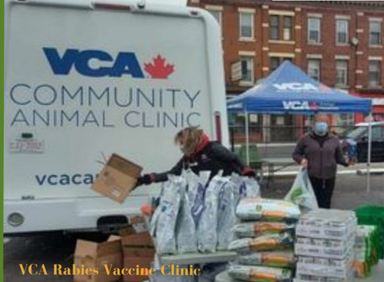
VCA Rabies Vaccine Clinic