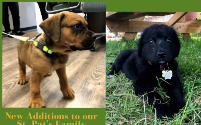
New Additions to our St. Pat's Family