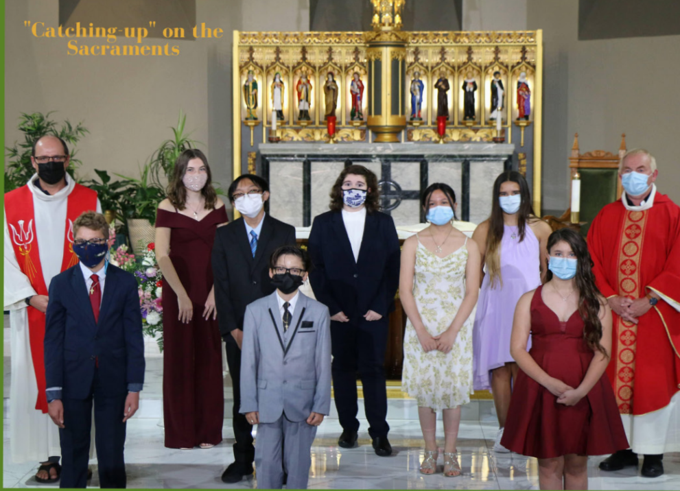
"Catching-up" on the Sacraments