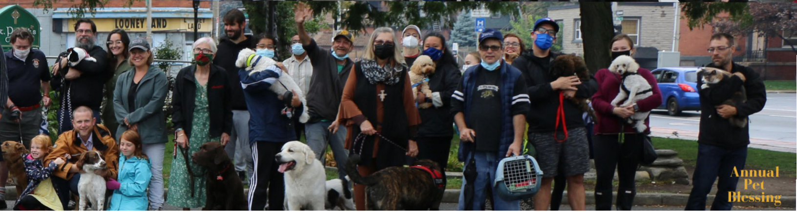
Annual Pet Blessing