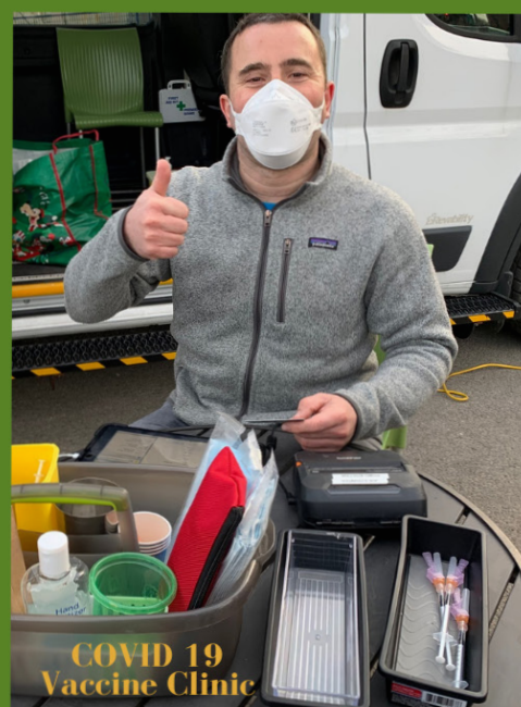
COVID 19 Vaccine Clinic