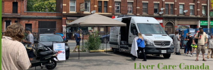
Liver Care Canada