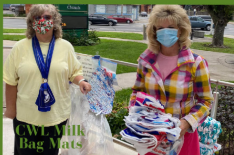
CWL Milk Bag Mats