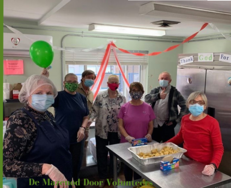
De Marneed Door Volunteers