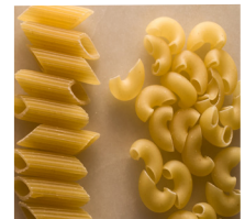
Dry pasta (macaroni, rotini, penne)