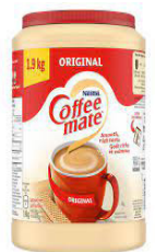
Coffee Whitener/ Creamer