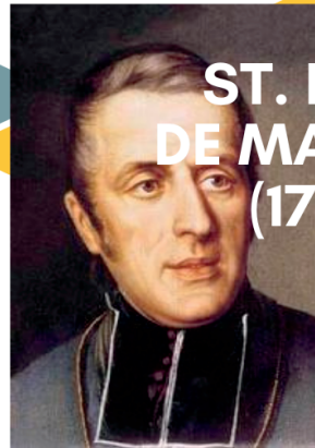
ST. EUGENE DE MAZENOD (1782-1861)

St. Eugene De Mazenod is the founder of the Missionary Oblates of Mary Immaculate. He was born into an aristocratic family in southern France shortly before the French Revolution, and experienced the exile and devastation of that time. After a conversion, Eugene entered a seminary in Paris and was ordained a priest in 1811.